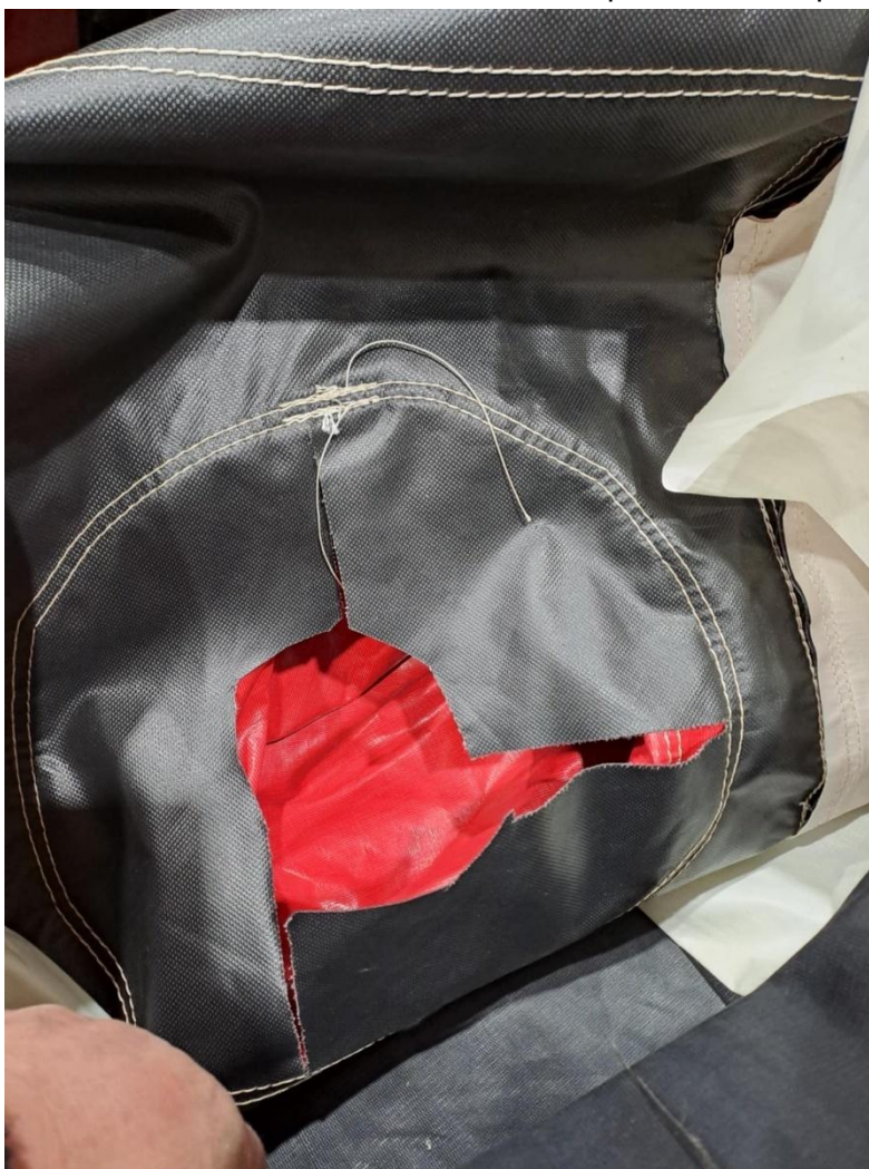
Figure 3: Failed aperture enabling object being pushed into the bed of the device

The inflatable should be failed under the entrapment section of the inspection report, with sufficient detail and photos to help show the risk you have identified. The manufacturer should be contacted for advice before repairs are completed.