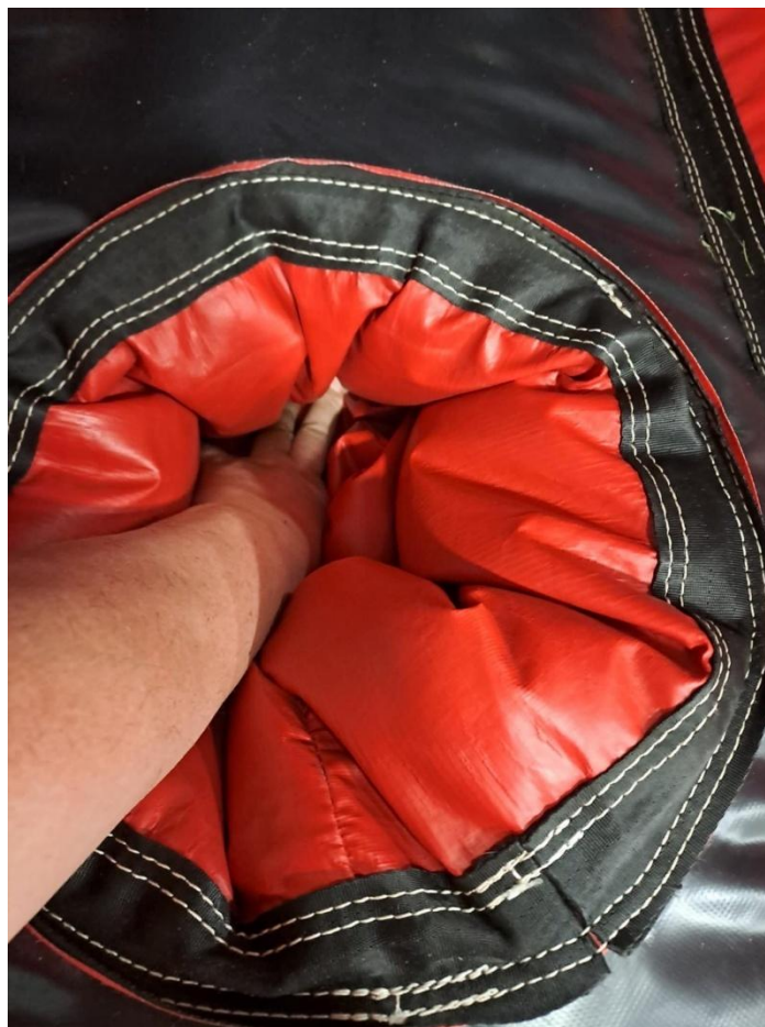
Figure 2: Example of a crushed inflatable object being pushed into the bed of the device

If the device is operating at the correct pressure, and you believe the aperture into the object may enable an entrapment issue to occur, you should contact the manufacturer in the first instance.