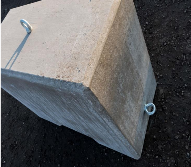
Figure 1 Concrete blocks – with appropriate fixing point & weighing a minimum of 163kg